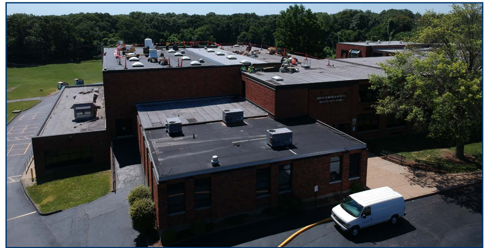
Crews replaced 357 roof squares at Oakville Middle School.

Bierbaum Elementary, Trautwein Elementary, Bernard Middle, Buerkle Middle, Oakville Middle, Washington Middle and Oakville High are all scheduled to have portions of their roof replaced using funds generated from Prop A and Prop S within the next five years.