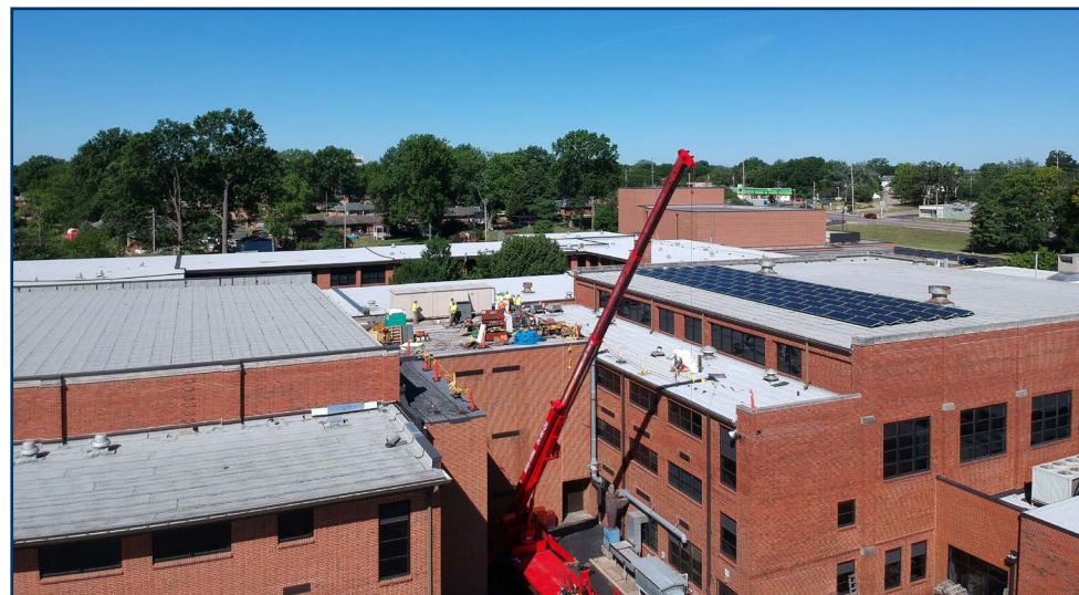
Crews replaced a portion of the roof at Mehlville High School this summer. See more facilities work on page 4.