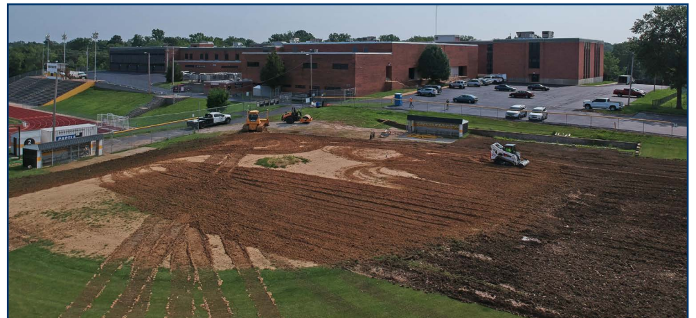
Crews are expected to complete extensive safety improvements to the Oakville High School baseball/softball field near the end of October.

The project is being paid for using funds generated by Prop S. The baseball/softball fields at Mehlville High School are scheduled for similar safety upgrades through Prop S. That project is a larger project since the baseball field will be relocated due to a storm drain in the outfield. Due to the high price of construction materials, there are plans to rebid that project for next summer.