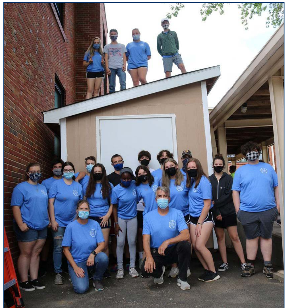
Above: Mehlville High School Geometry in Construction students with their completed shed at MOSAIC Elementary School.