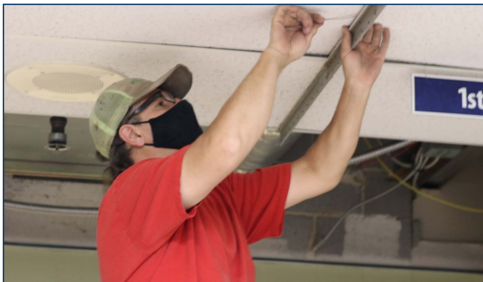
Forder Elementary underwent a complete HVAC renovation this summer.

This project was paid for using Prop S funding. John Cary Early Childhood Center, Beasley Elementary School, Rogers Elementary School and Mehlville High School are all slated for future HVAC replacement using Prop S funds.